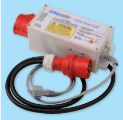
Active three-phase adapter TGA