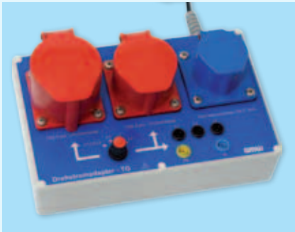
Passive three-phase adapter TGP